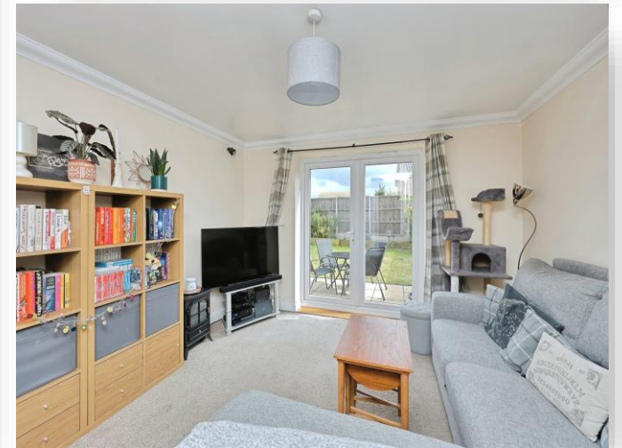
Wellesley Close, Poringland, Norwich, NR14 7XH