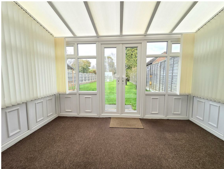
Having double glazed windows to the side and rear, plus double doors opening to the rear garden.