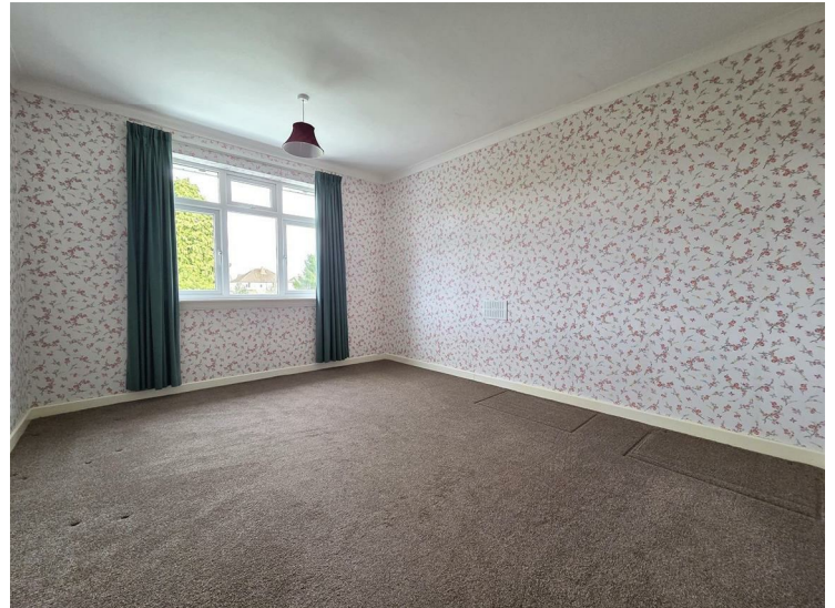
Having a double glazed window to the rear, coving to the ceiling, and radiator.