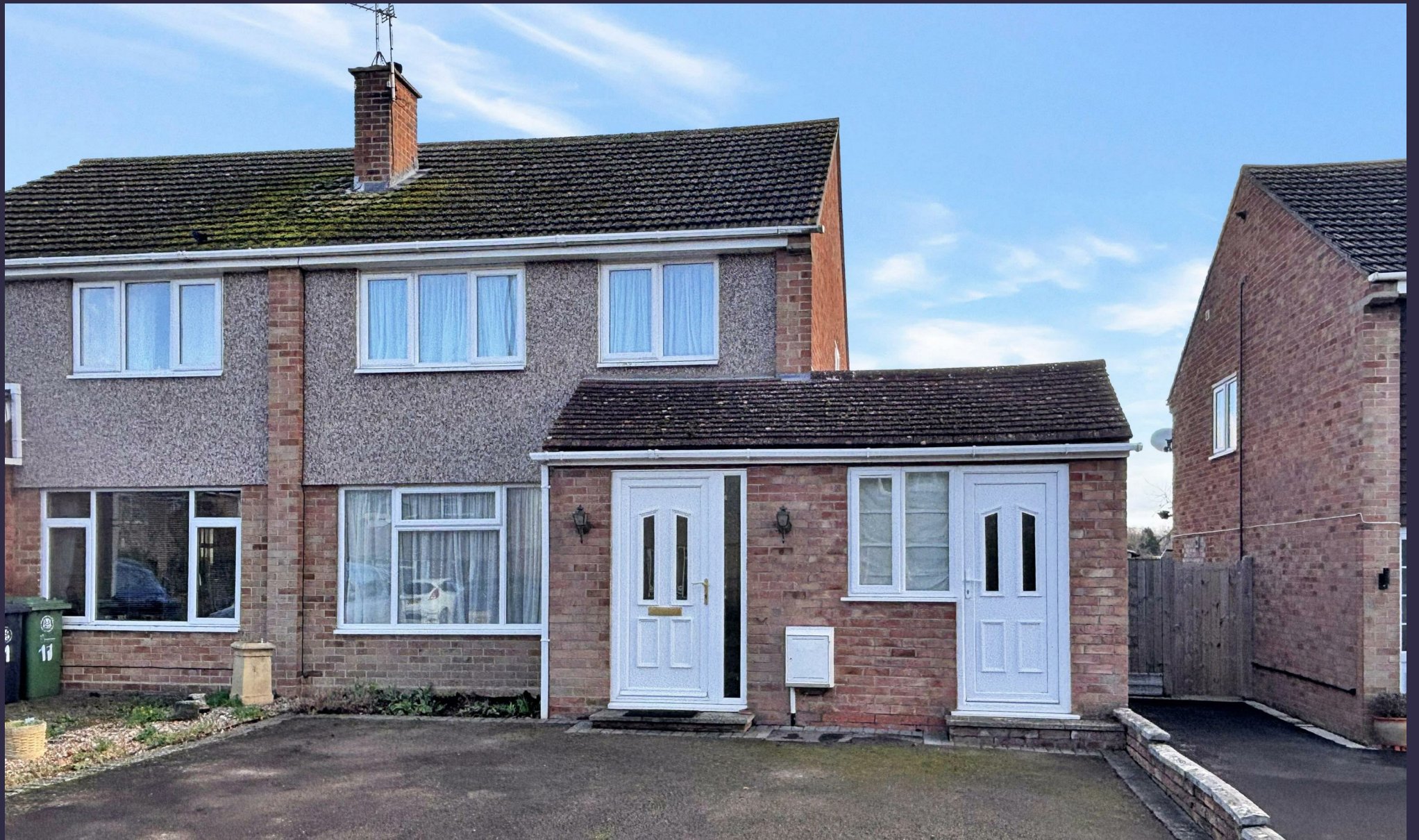
12 Ash Tree Close, Wellesbourne, Warwick, CV35 9SA