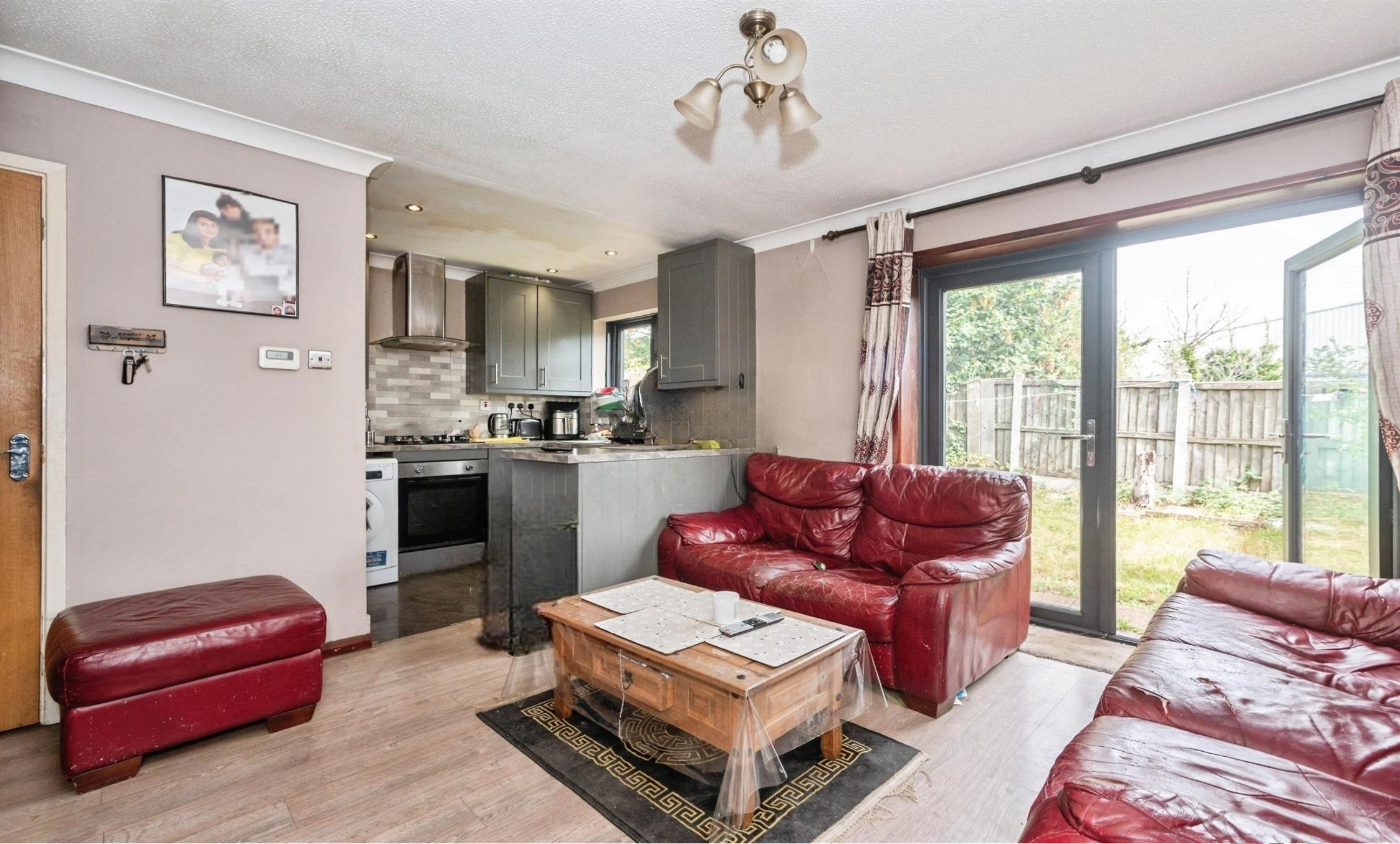
Charlotte Place, Grays RM20 3JF