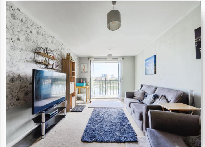
Rutherford House, Searle Drive, Gosport PO12 4WG