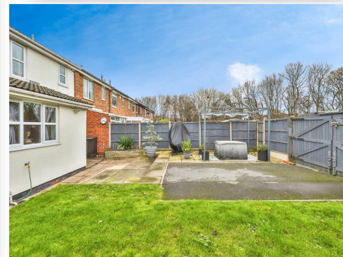
Linden Avenue, Nottingham NG11 8SB