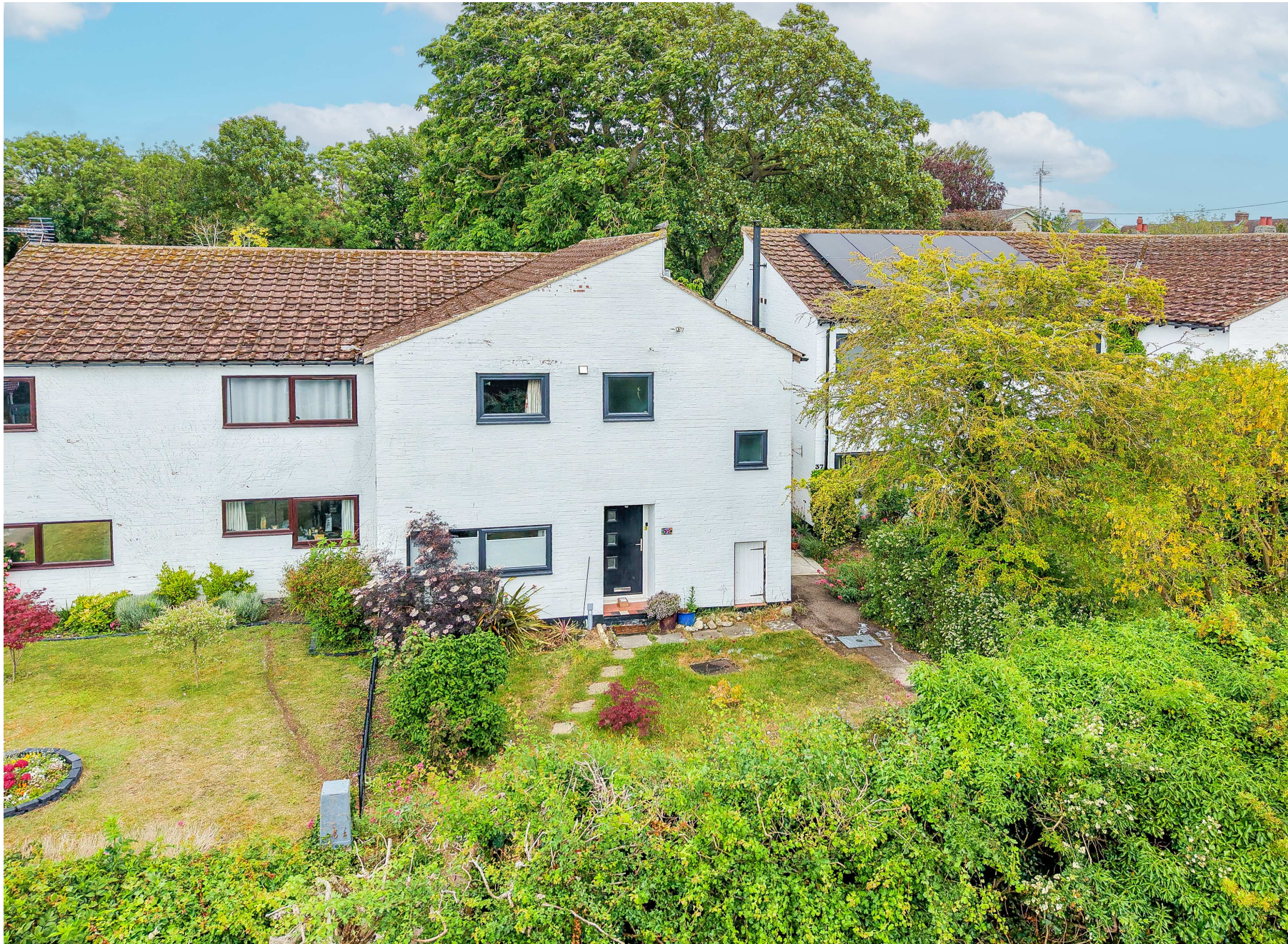
Cage Hill, Swaffham Prior, Cambridgeshire