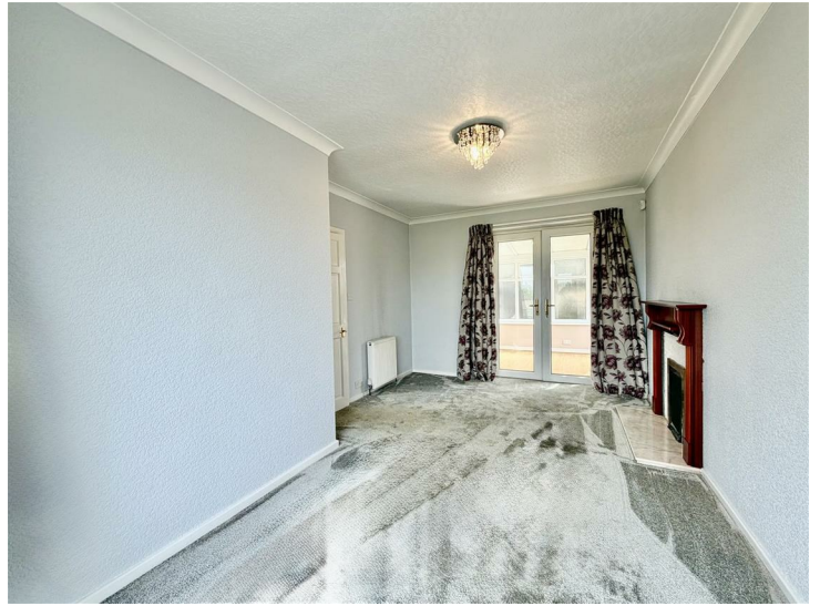
CONSERVATORY 10'2 x 8'5 apx