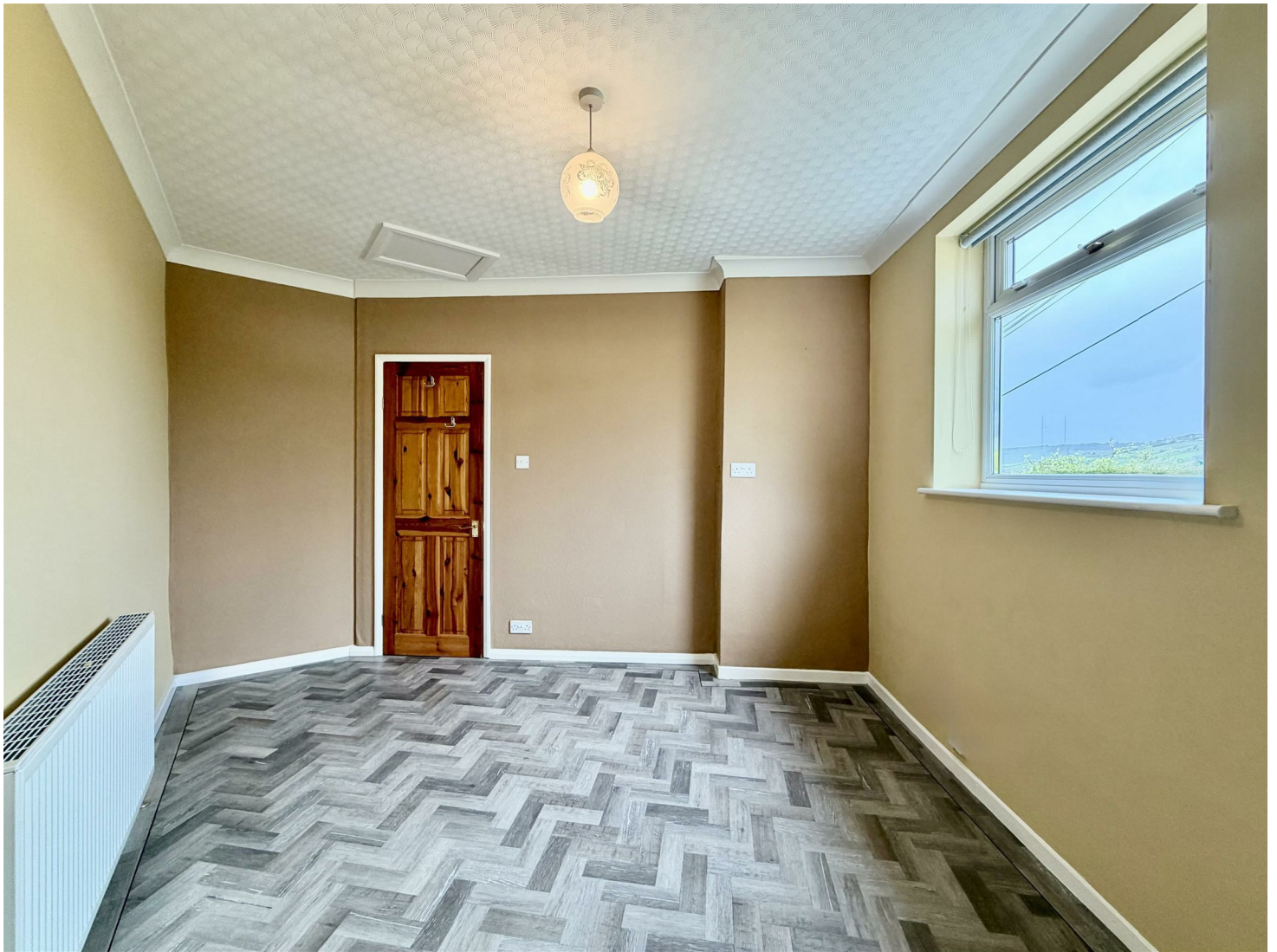
BEDROOM TWO 12'3 x 9'8 maximum