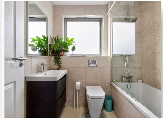
Weir Street, Stirling, FK8 1FH