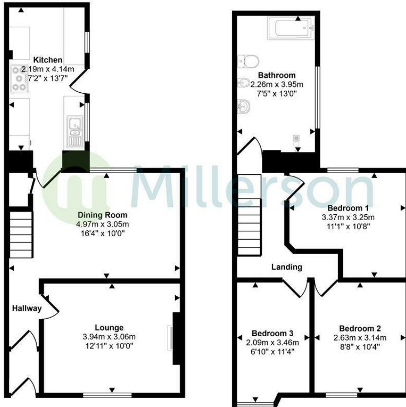
Ground Floor Approx 42 sq m / 449 sq ft

Approx Gross Internal Area 84 sq m / 902 sq ft