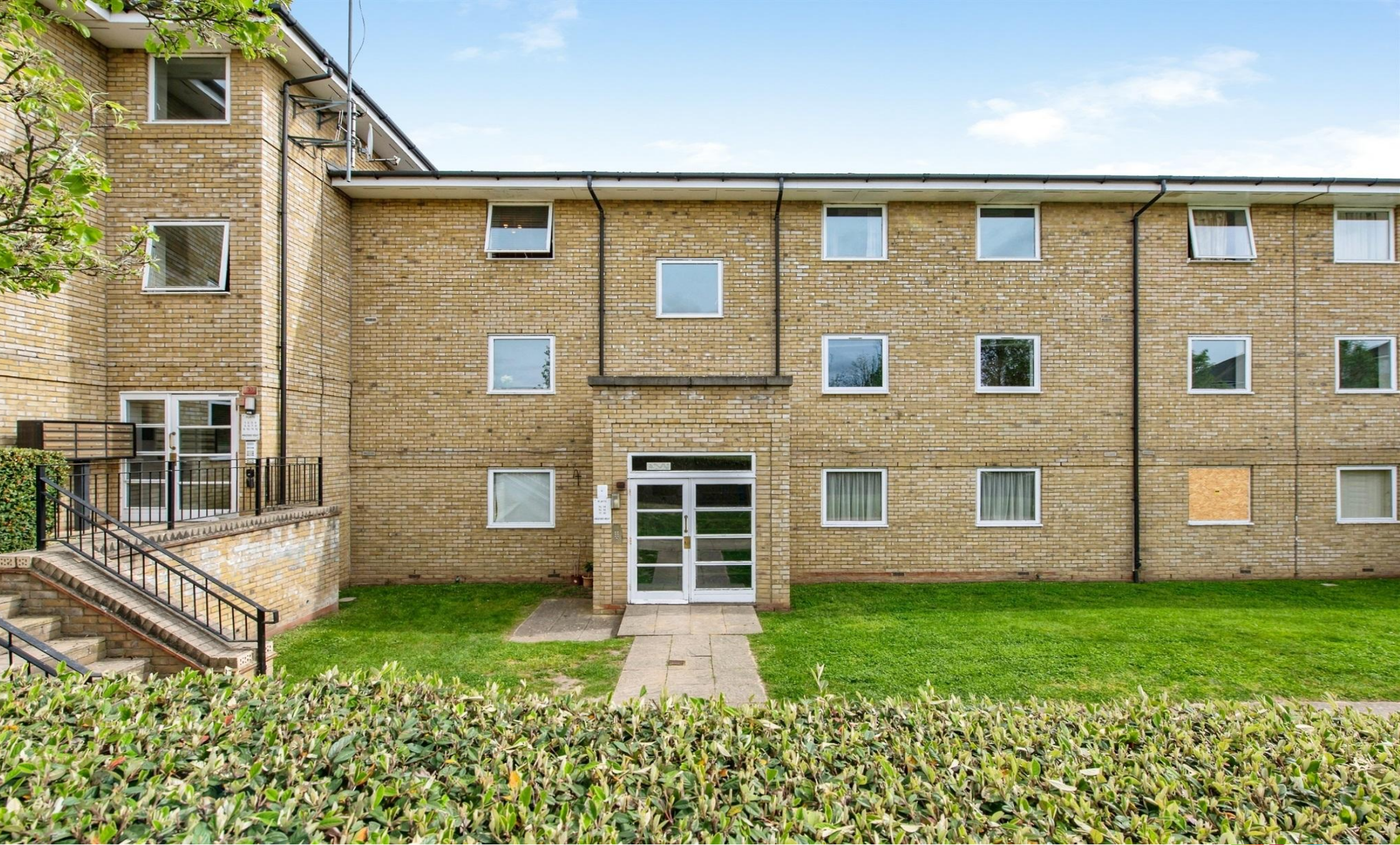
Kingfisher Heights, Hogg Lane, Grays RM17 5QQ