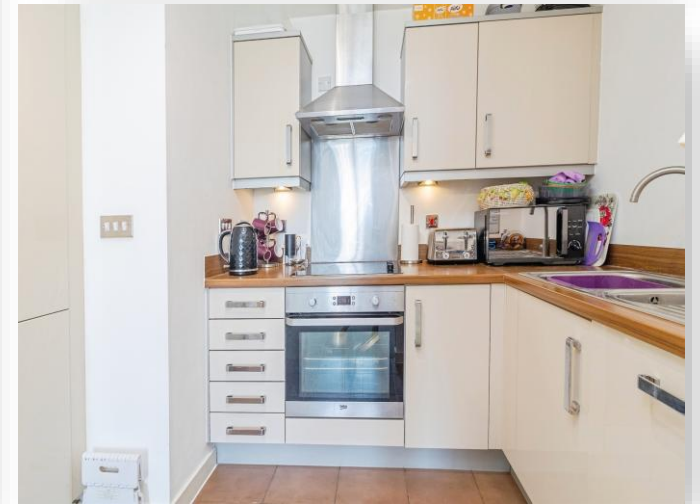
Dakota House, Mortimer Square, Milton Keynes, MK9 2FB