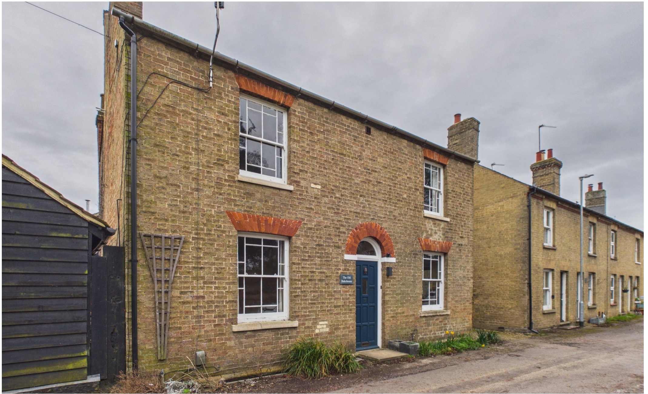
Church Close, Cottenham CB24 8SL