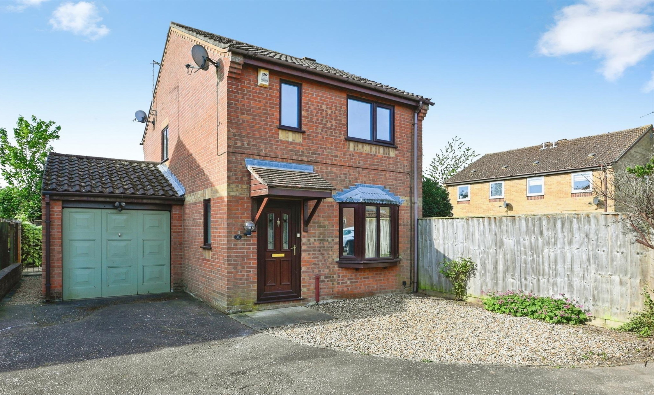
Stiffkey Close, Watlington, King's Lynn, PE33 0JT