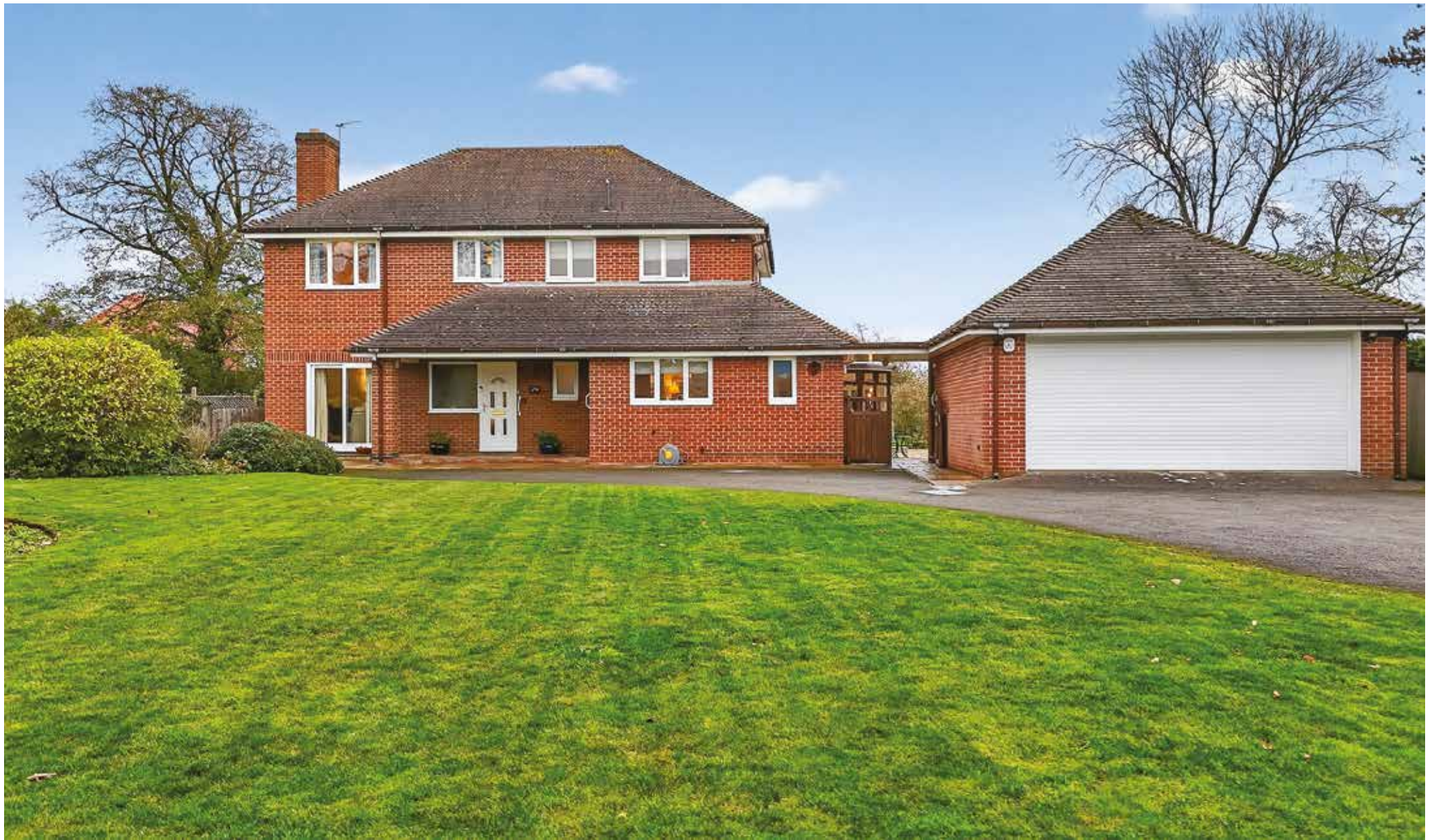
4 Grove Park Etwall | Derbyshire | DE65 6NS