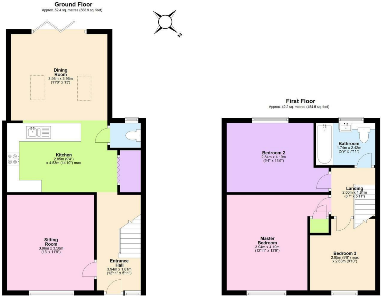
Total area: approx. 94.6 sq. metres (1018.4 sq. feet) 44 Cowling Drv, Bristol