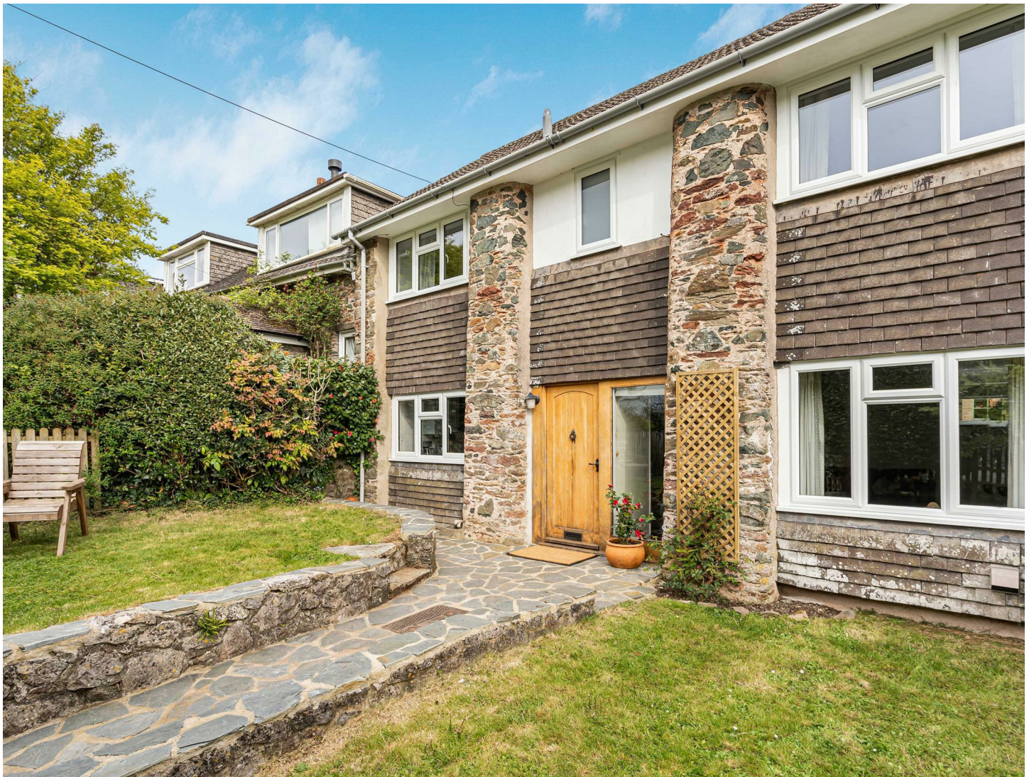
4 Brooking Barn