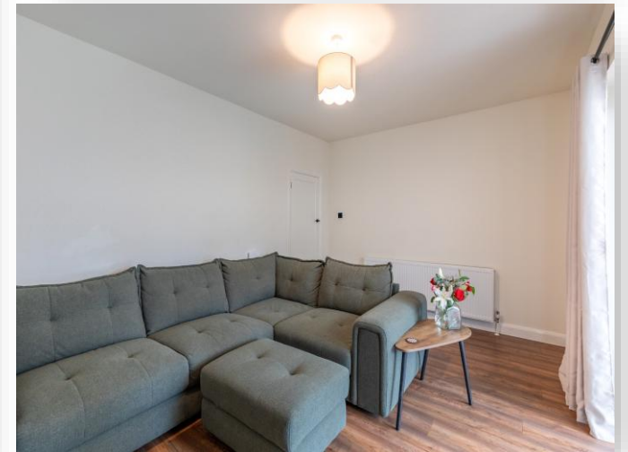
Stanwell Way, Wellingborough NN8 3DG