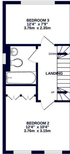
1ST FLOOR 332 sq.ft. (30.8 sq.m.) approx.