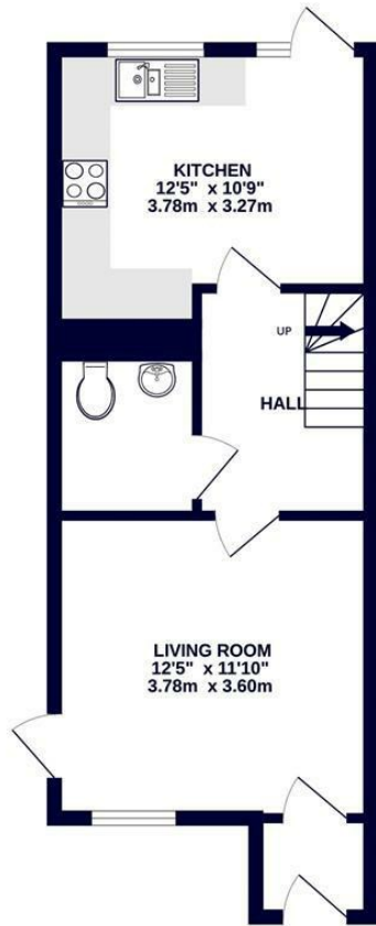
GROUND FLOOR 383 sq.ft. (35.6 sq.m.) approx.