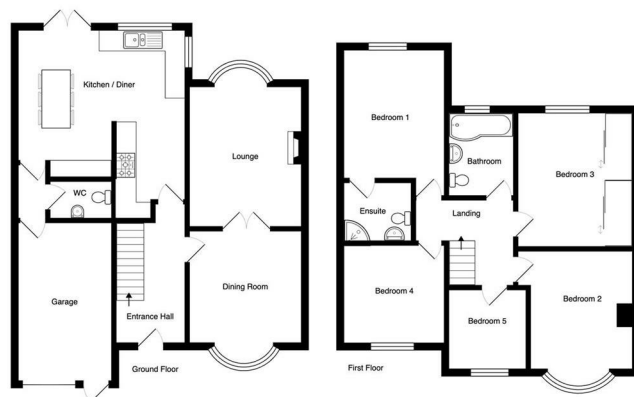
Total Area: 153.4 m 2 ... 1651 ft 2

The fee is non-refundable and paid directly to Moverly. We receive a portion of this fee for facilitating the checks