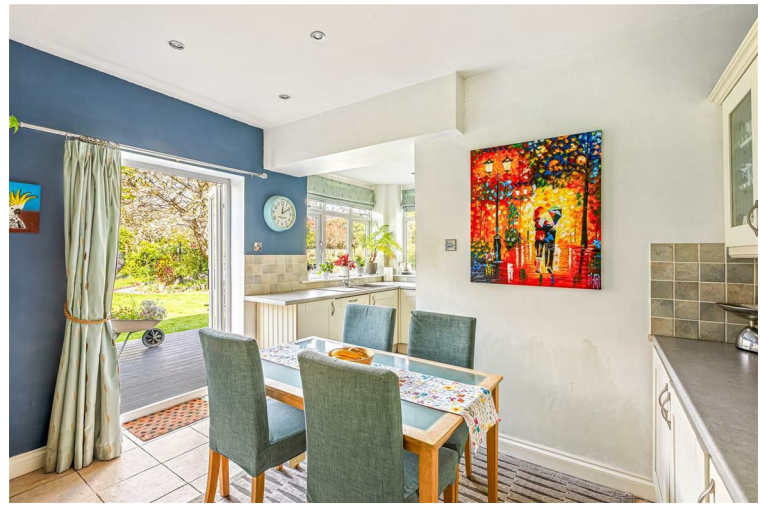
DINING AREA 12'4" x 9'3" (3.76 x 2.84)

Fitted units with worktops and tiled splashbacks, integrated washing machine, space for American fridge freezer, radiator, spot lights, tiled floor, pair of double glazed doors to rear aspect opening out onto the decking area.