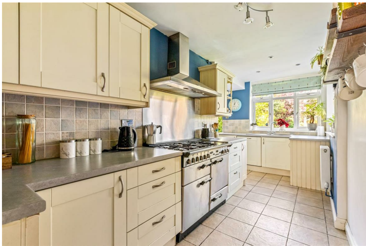
KITCHEN / DINER 17'8" x 6'0" (5.39 x 1.83)

Fitted units with worktops and tiled splashbacks, integrated washing machine, space for American fridge freezer, radiator, spot lights, tiled floor, pair of double glazed doors to rear aspect opening out onto the decking area.