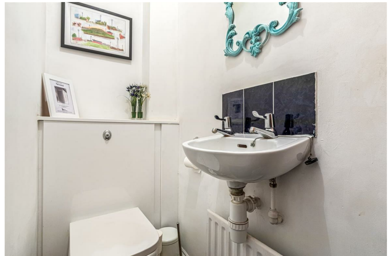
DOWNSTAIRS W/C 6'2" x 2'7" (1.90 x 0.81) Low level W/C, wash hand basin, radiator, tiled floor.