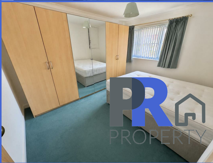
7 Campania Grove, Luton, LU3 4DD £975 PCM