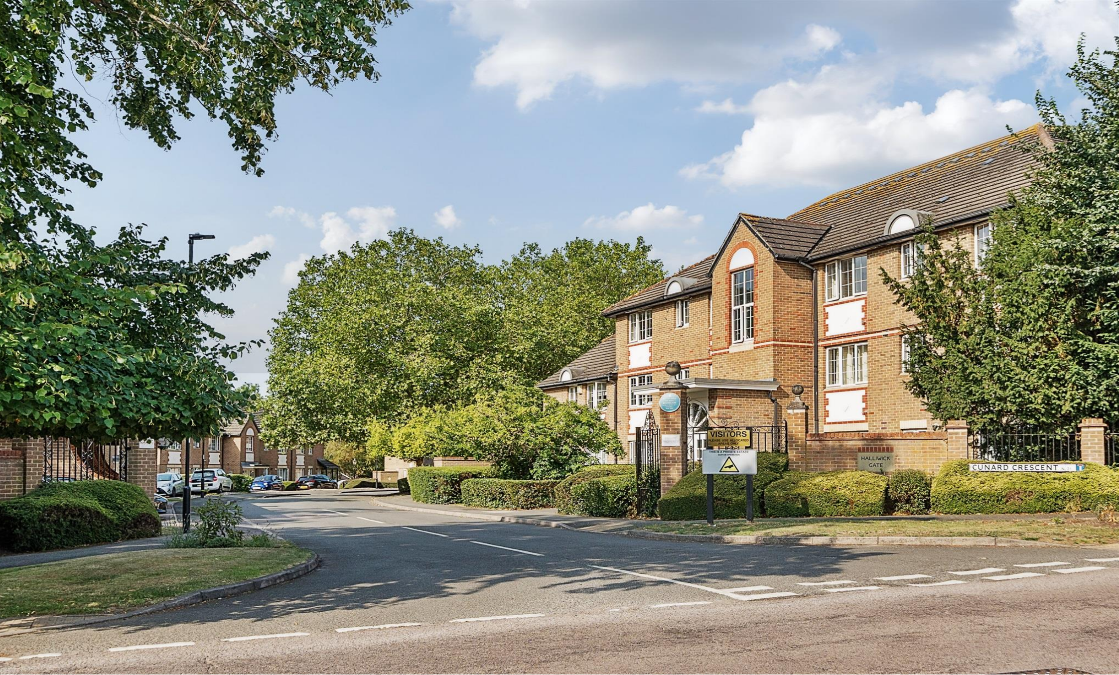
Braikenridge House, Cunard Crescent, London, N21 2TF