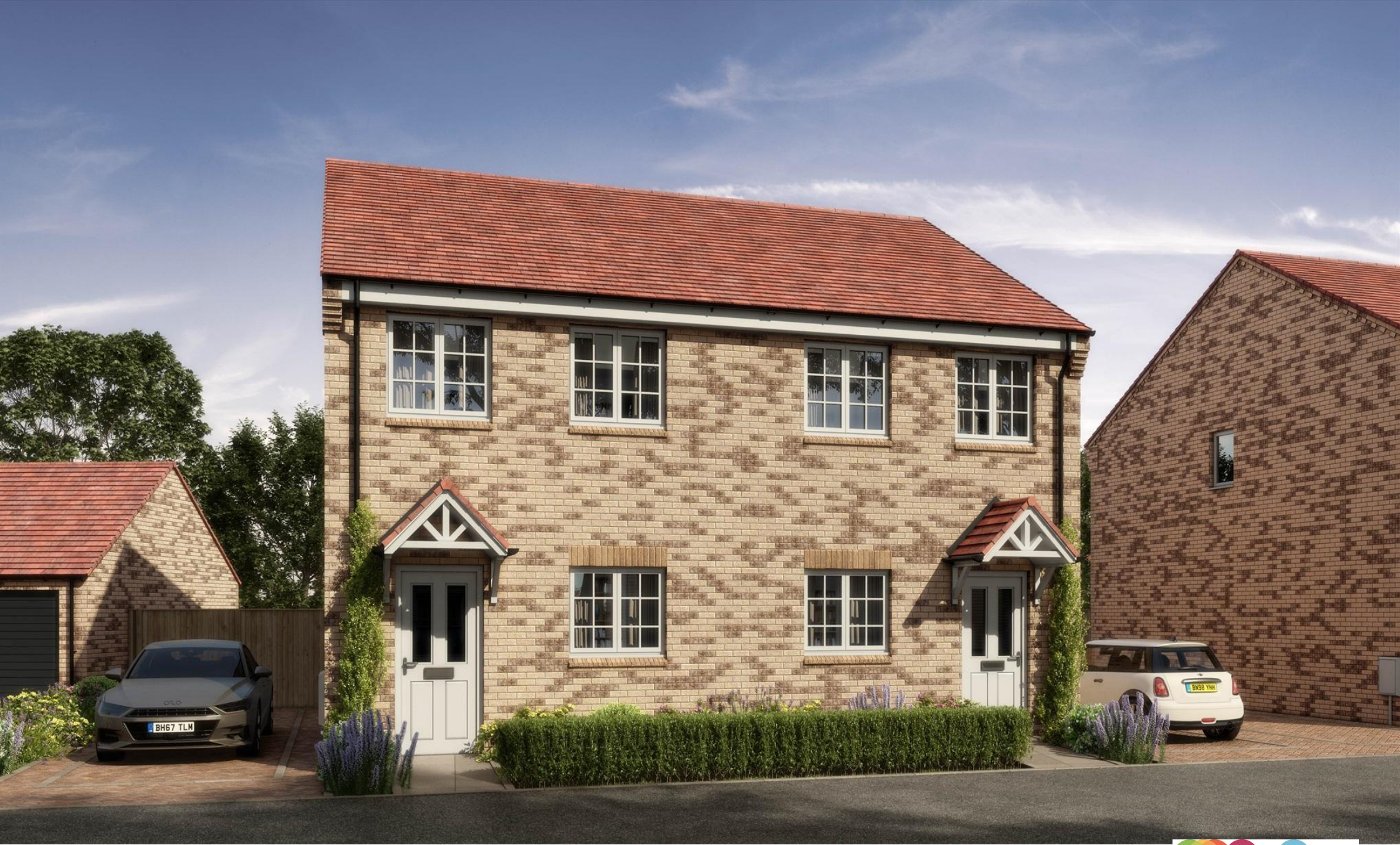
The Amber, Barrowby Place, Grantham NG31 8XT