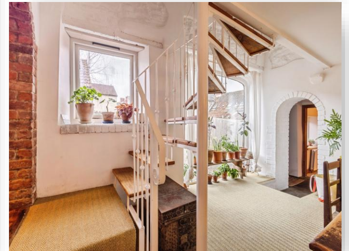
The Old Shambles, Silver Street, Cheddar, BS27 3LE