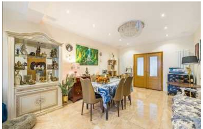
Cairnfield Avenue, NW2