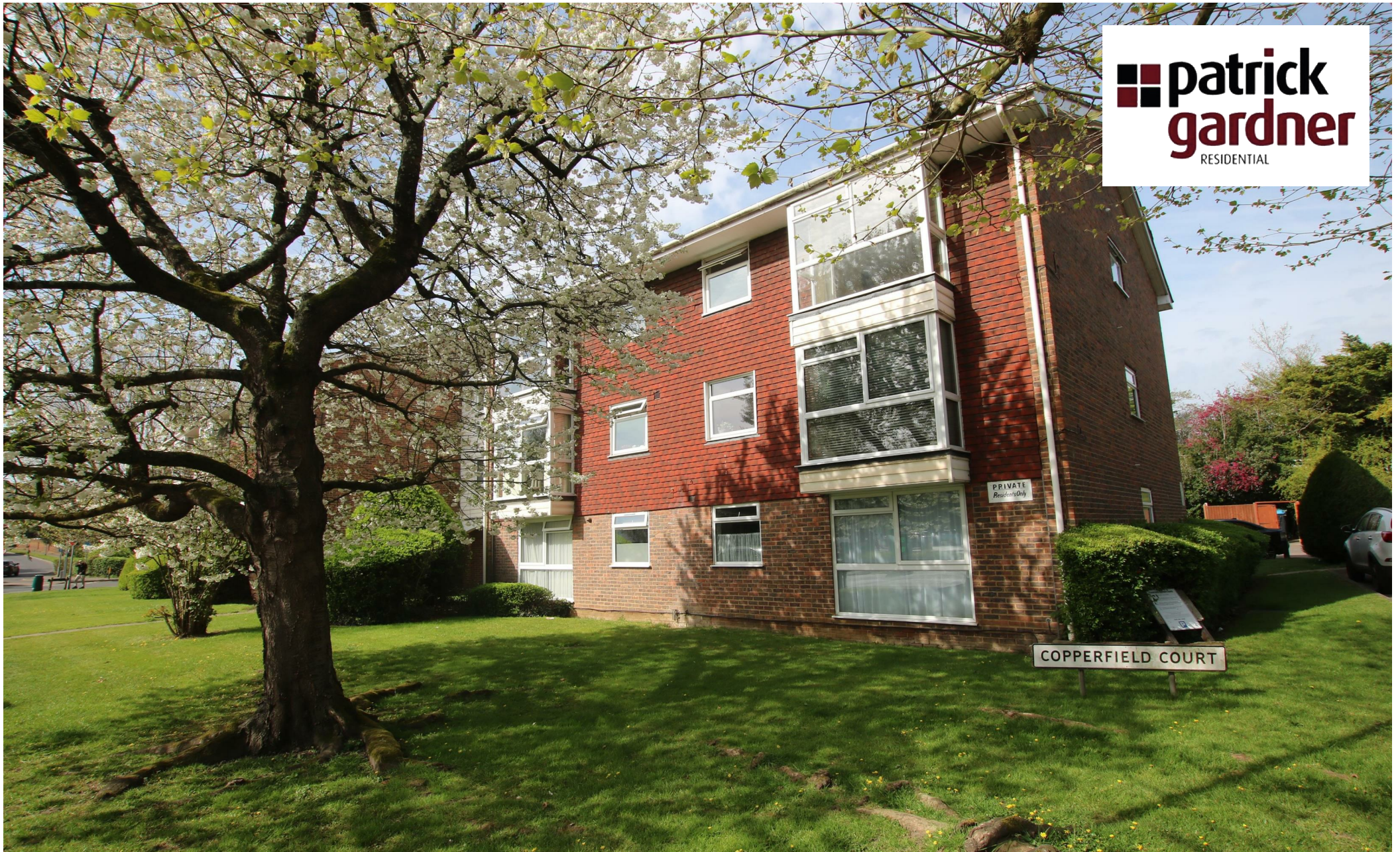
8 Copperfield Court, Leatherhead, KT22 7LD