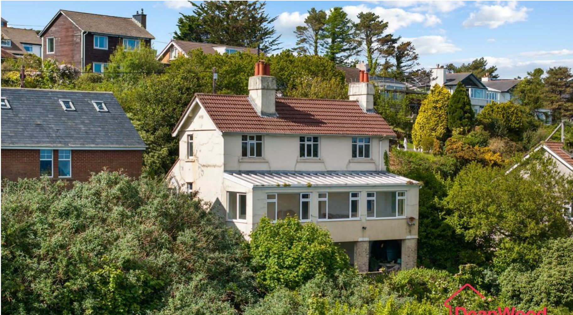
Headlands Pinfold Hill, Laxey, Isle of Man, IM4 7HL Offers In The Region Of £350,000