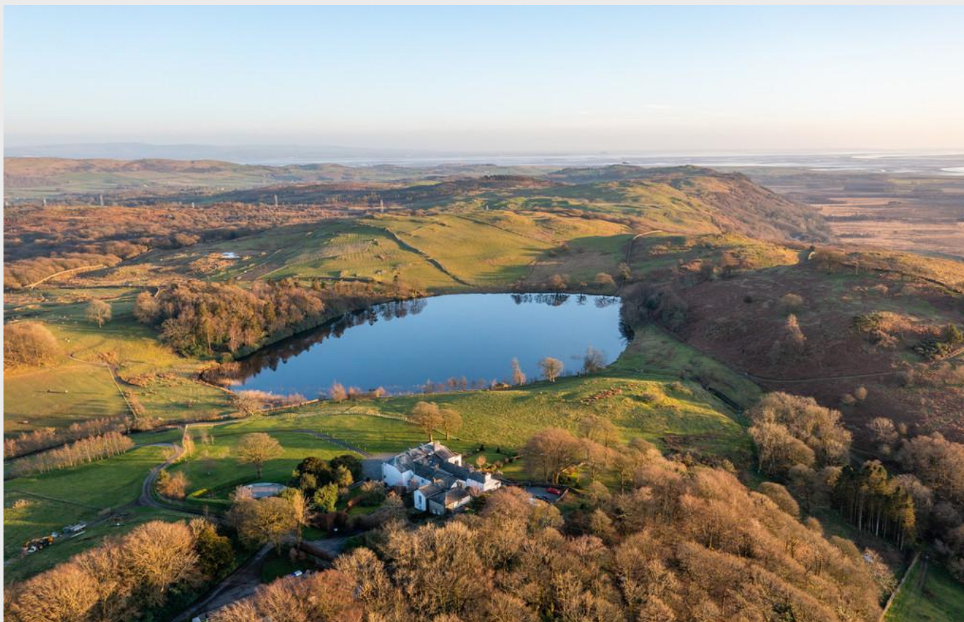
Bigland Hall Estate & Tarn