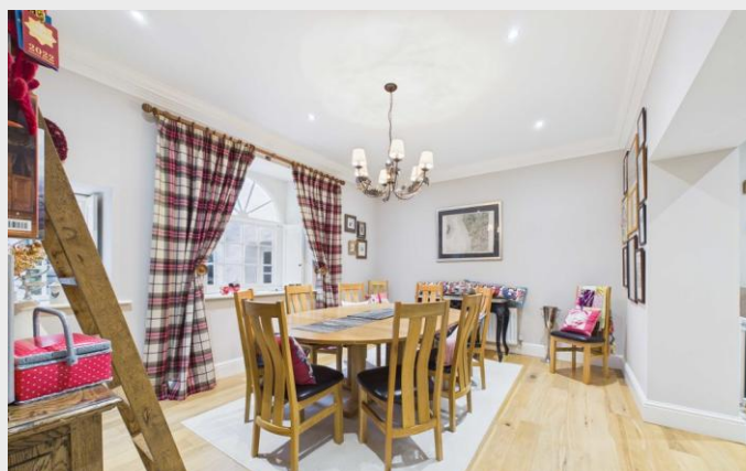
Tarn House - Dining Room