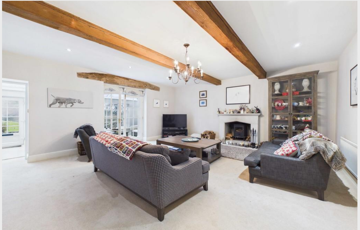
Tarn House - Lounge

From the Inner Hall the return staircase leads to the First Floor where there are 2 sizeable Double Bedrooms both with charming fireplaces and their own tiled, modern En-suite Shower Rooms. Bedroom 1 enjoys breathtaking, panoramic views of the open countryside and tarn. Bedroom 2 has a pleasant rear aspect. Bedroom 3 is a cosy double room with deep set window with side aspect. Bedroom 4 is currently utilised as an Office with attractive fitted furniture. The main Family Bathroom is tiled and has a modern white suite comprising WC, wash hand basin, bath with