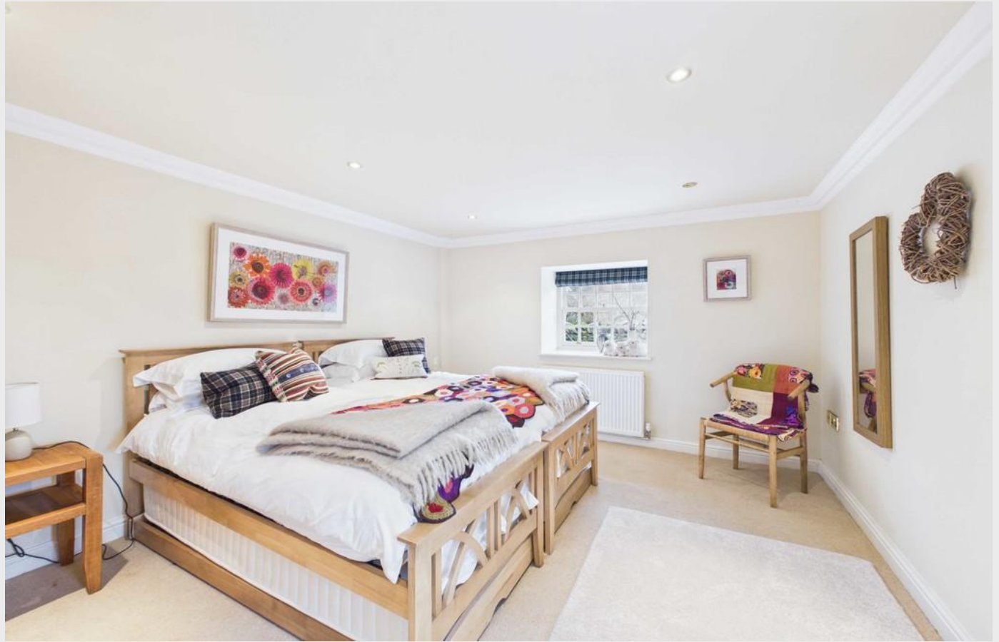
The Heights - Bedroom