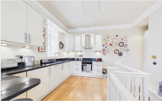
The Heights - Kitchen/Dining/Living