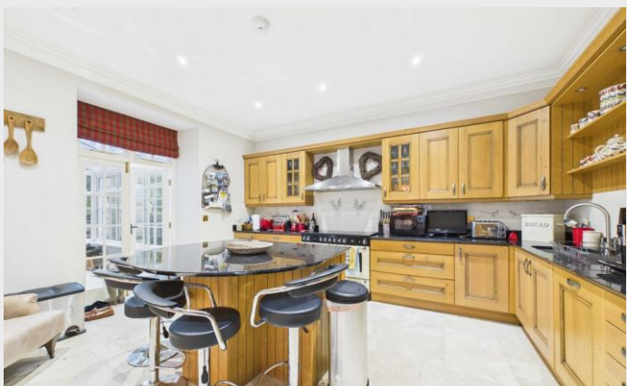
Tarn House - Kitchen