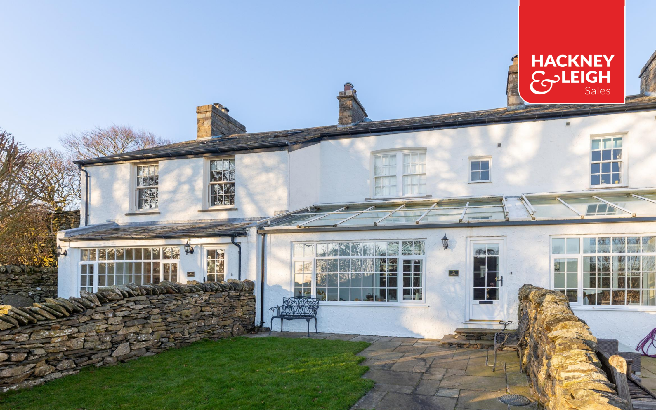
Tarn House & The Heights, Bigland Hall Estate, Backbarrow