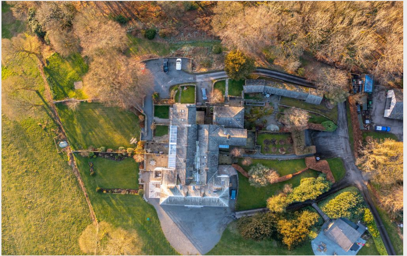
Bigland Hall Estate