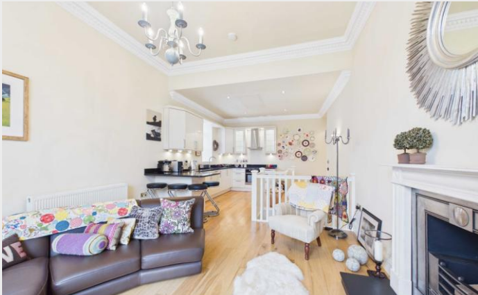
The Heights - Living/Dining/Kitchen