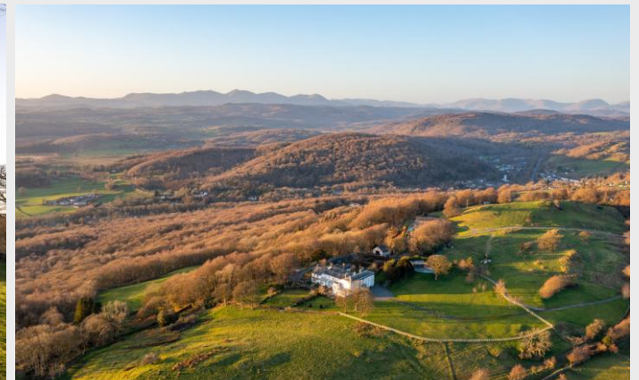
Bigland Hall Estate