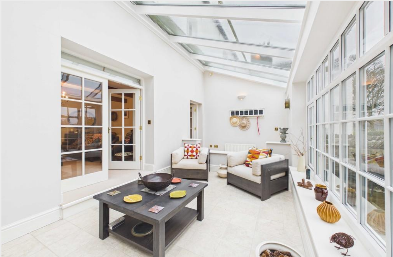
Tarn House - Conservatory