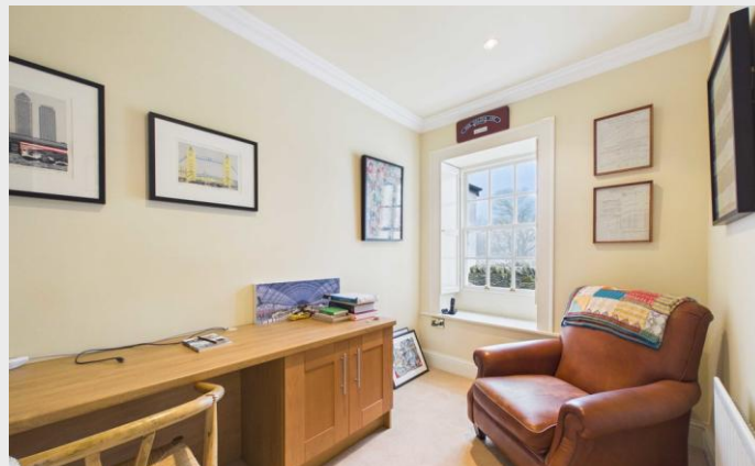
Tarn House - Bedroom4/Study

Location At the Northern end of the Cartmel Peninsula and in the delightful Lake District National Park, Bigland has an elevated position above the valley of the River Leven which crashes its way over waterfalls, rocks and weir, from the foot of Windermere at Newby Bridge. There are lovely views from the grounds over the estuary, the surrounding woodlands, fields and over the peaceful Bigland Tarn. The local network of Public Footpaths takes you alongside the tarn and over the wider district, into the National Park and its many amenities. The local market town of Ulverston is only about 10 minutes drive. The popular historic village of Cartmel with its steeplechase meetings and the highly prized L'Enclume restaurant is also 10 minutes away. The A590 offers speedy, convenient access to the M6 Motorway at junction 36 and there are good rail connections at Ulverston, Grange-over-Sands and Windermere, which all offer a wide variety of local shopping and amenities.