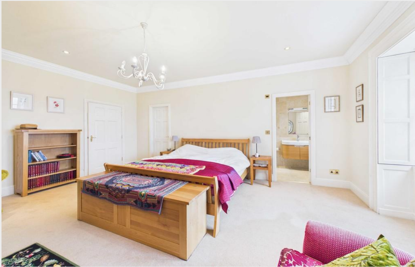
Tarn House - Bedroom 1