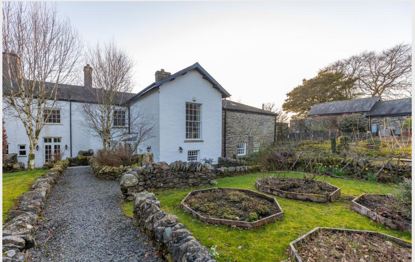
Bigland Hall Estate