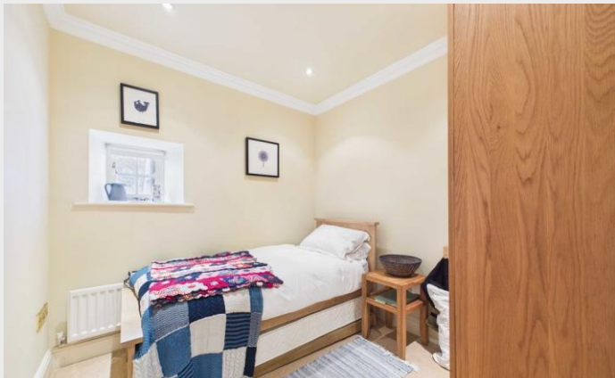
Tarn House - Bedroom 3