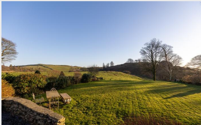
Tarn House Garden