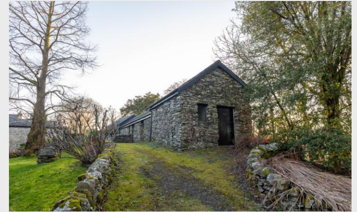
Tarn House Store

property until these checks have been completed. In the event the property is being purchased in the name of a company, the charge will be £150 (incl.