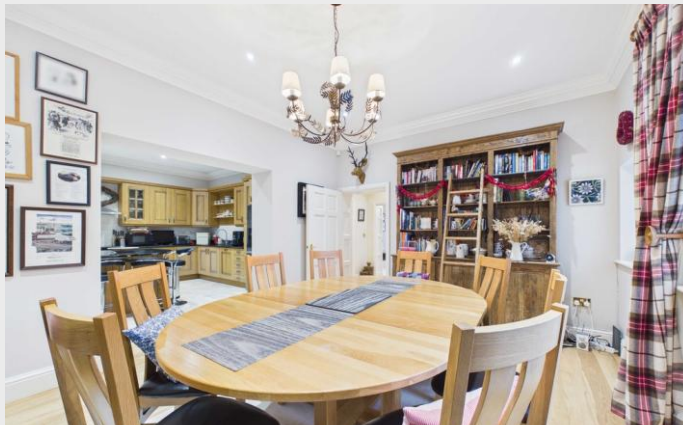
Tarn House - Dining Room