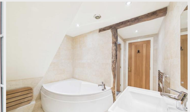
The Heights - Bathroom