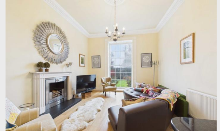
The Heights - Living/Dining/Kitchen

Anti-Money Laundering Regulations (AML): Please note that when an offer is accepted on a property, we must follow government legislation and carry out identification checks on all buyers under the Anti-Money Laundering Regulations (AML). We use a specialist third-party company to carry out these checks at a charge of £60.00 (incl. VAT) per individual or £50.00 (incl. vat) per individual, if more than one person is involved in the purchase (provided all individuals pay in one transaction). The charge is non-refundable, and you will be unable to proceed with the purchase of the