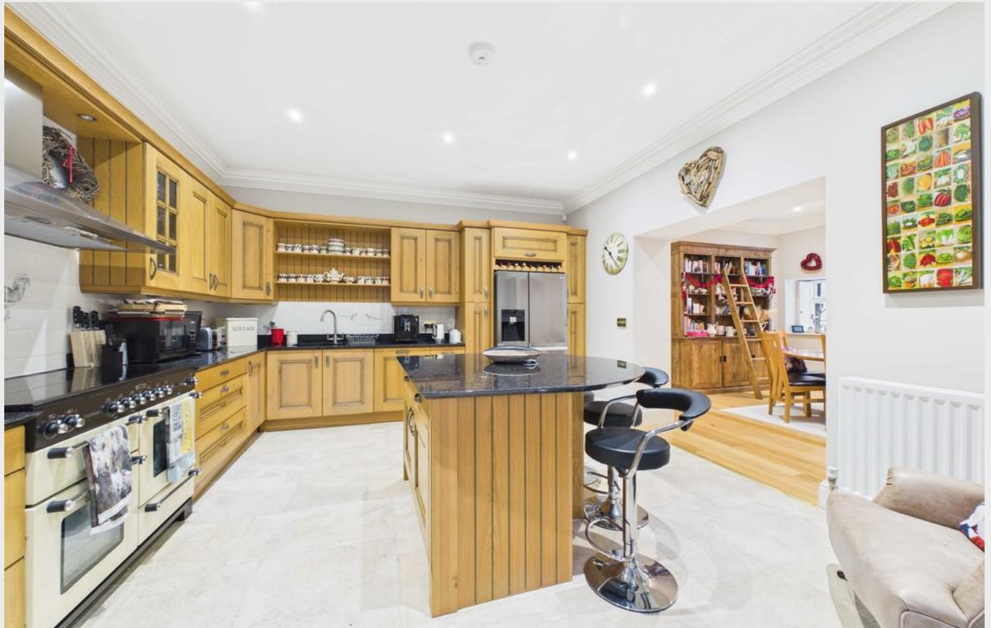
Tarn House - Kitchen

The rear door opens into the spacious Porch with door to The Heights and internal door to Tarn House. The Kitchen is spacious and well equipped with a top quality range of Oak wall and base cabinets with black granite work-surface and inset 1½ bowl sink unit and matching free-standing central island with breakfast bar. Cream Rangemaster oven with canopy cooker hood over, integrated dishwasher and American style fridge freezer. Recessed ceiling spot lights, tiled floor and corniced ceiling. An open archway leads to the formal Dining Room with 'Oak' effect flooring and is generous enough to host a good sized dinner party or family Christmas. The Inner Hall has stairs up to the First Floor and down to the Lower Ground Floor where there are 2 Cellar Rooms. The Cloak Room with WC and wash hand basin leads through in to the Boiler Room with Premier hot water cylinder and 2 electric heating boilers. Plumbing for washing machine. The Lounge is a most impressive room with exceptional dimensions. Feature Limestone fireplace housing the wood burning stove and exposed beams, delightful views, through the Sun Room to Bigland Tarn and countryside. The Sun Room is wonderful enjoying beautiful country views and a space to relax and soak up your surroundings whatever the weather. Access to Garden.