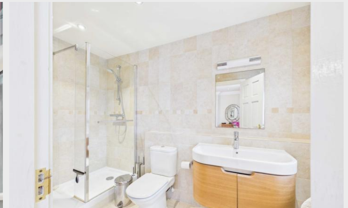
Bedroom 1 En-Suite Shower Room