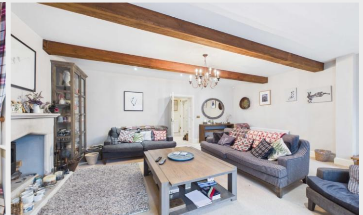
Tarn House - Lounge