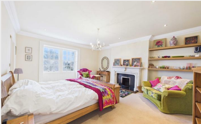
Tarn House - Bedroom 1