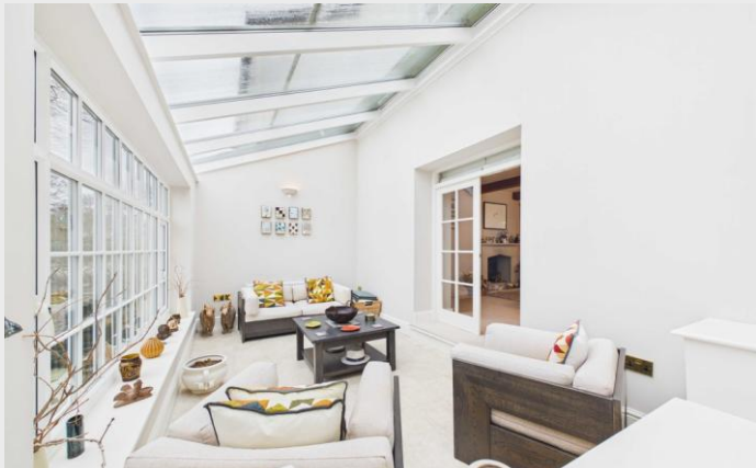
Tarn House - Conservatory