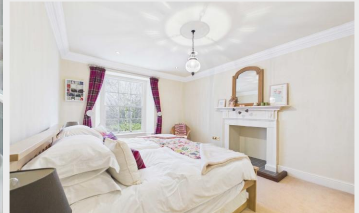
Tarn House - Bedroom 2