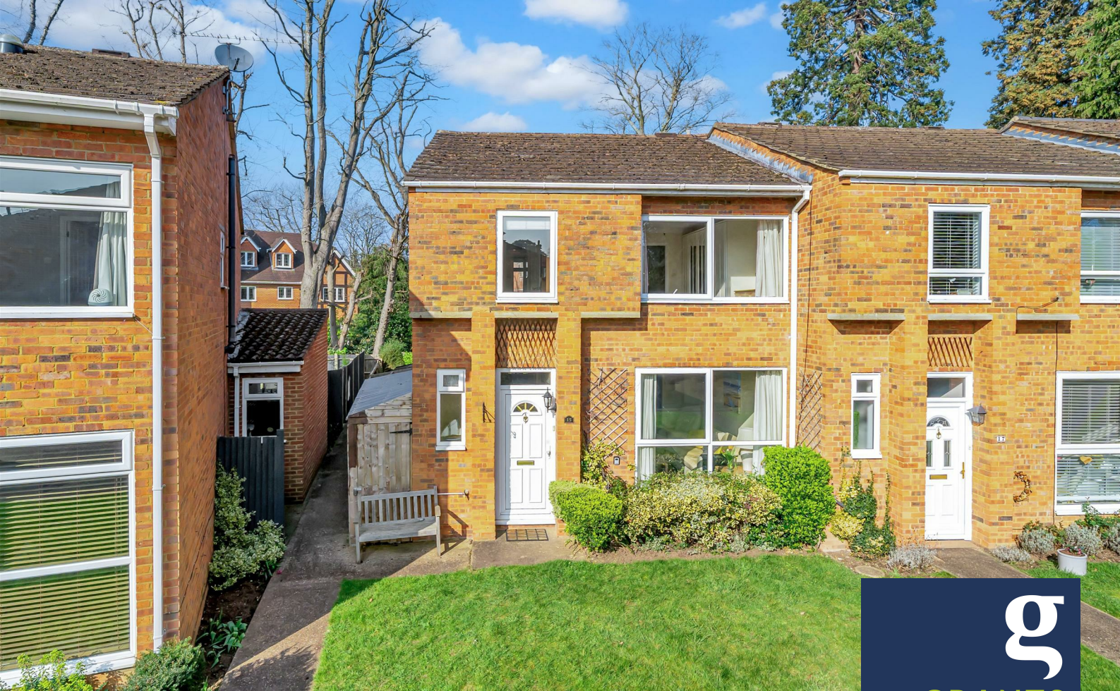
Egerton Place, Weybridge, KT13 0PF