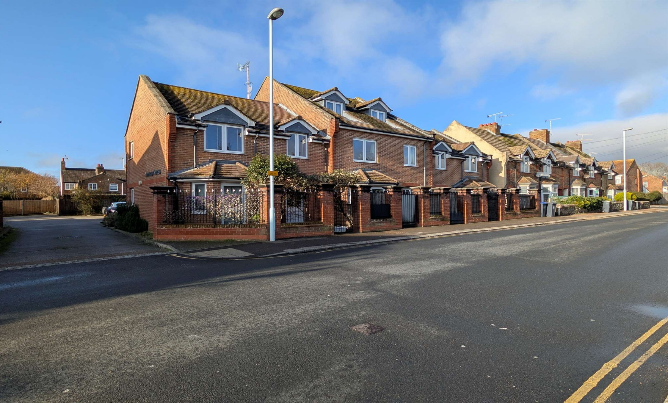
Mortimer House Penfold Road, Worthing BN14 8PG