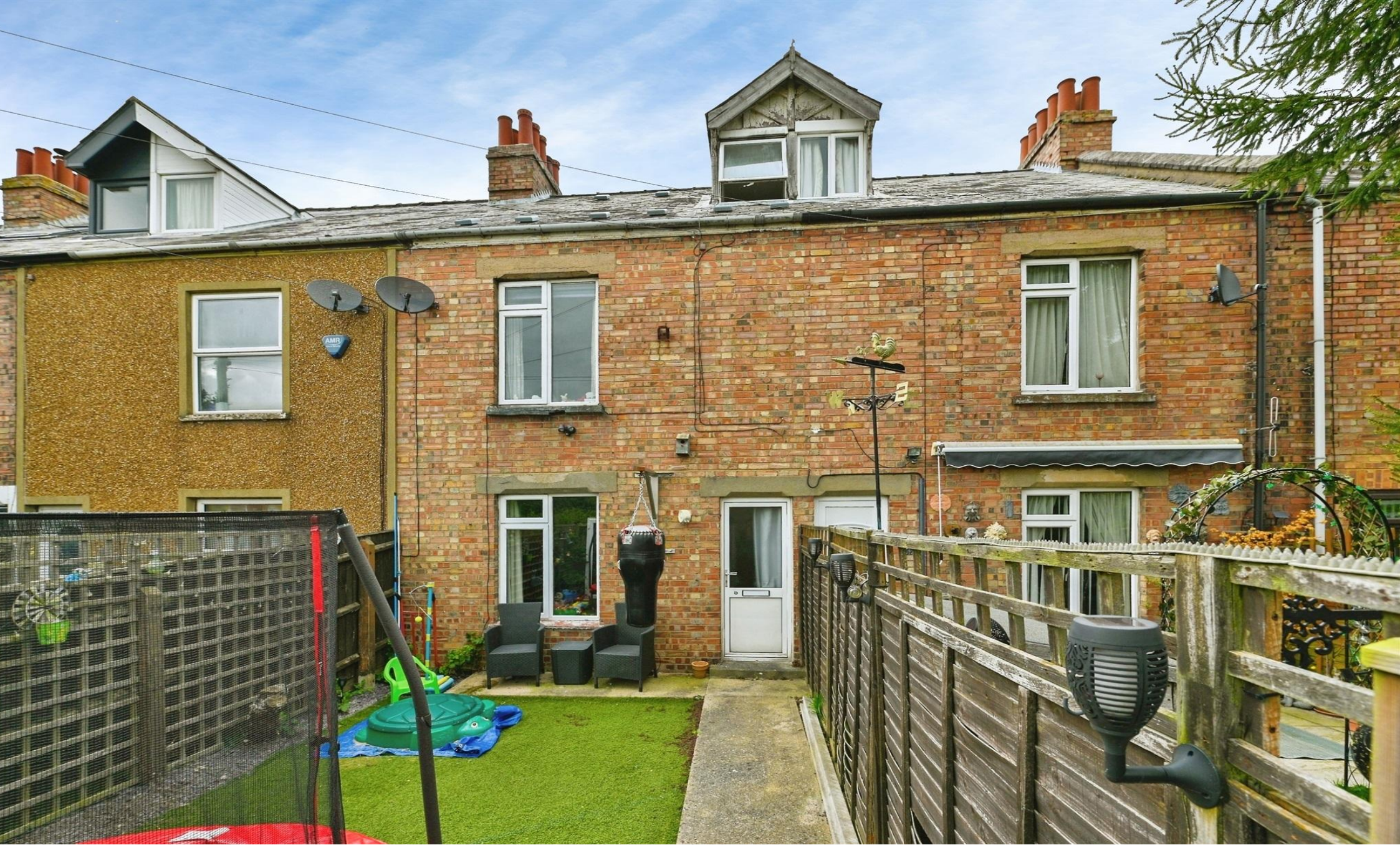
Manor Terrace, Terrington St. Clement, KING'S LYNN, PE34 4NF