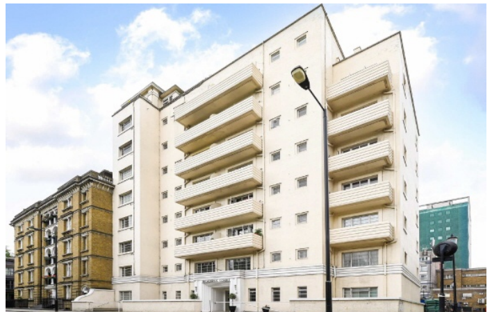
Palace Gardens Terrace, W8