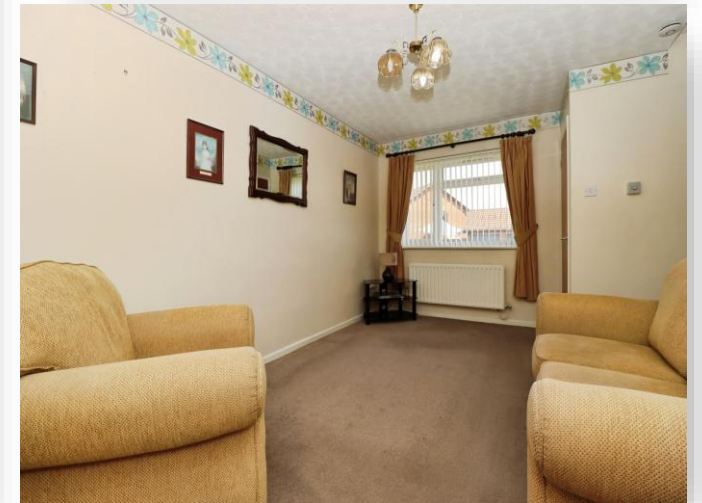
Kennet Close, WELLINGBOROUGH NN8 5ZP