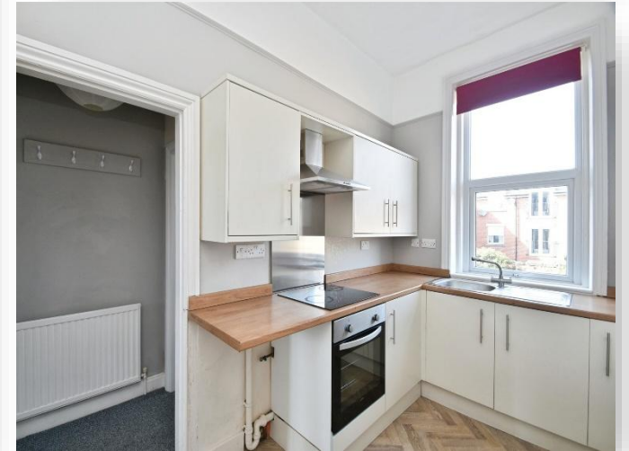
Flat 2 East Parade, Harrogate HG1 5LR