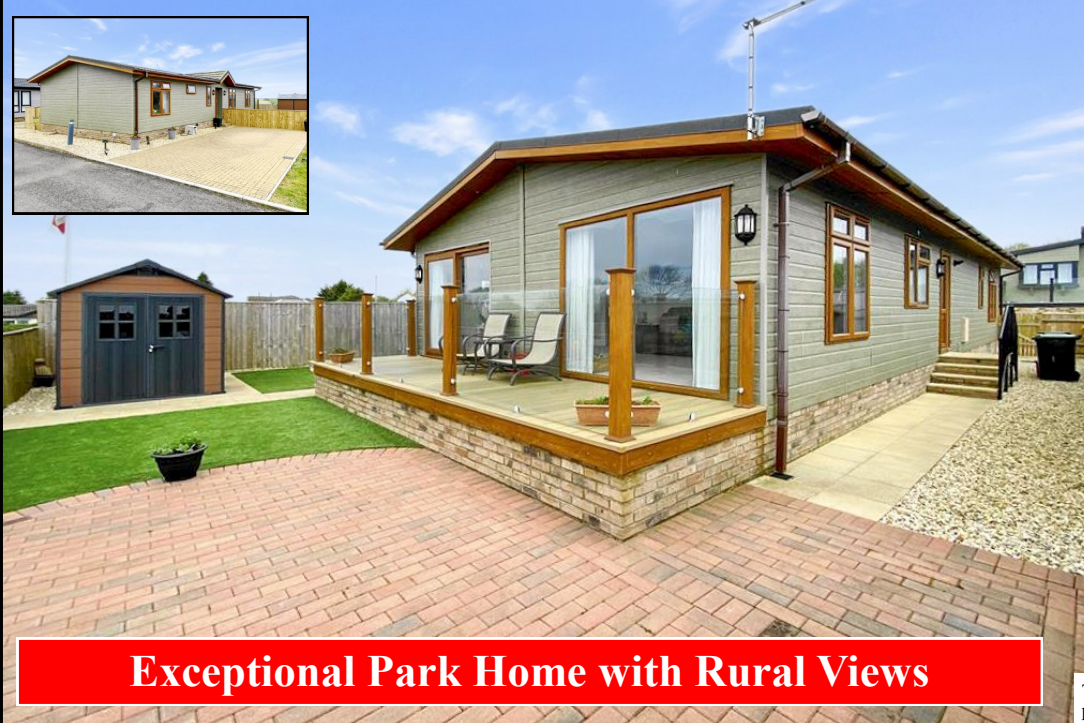
Exceptional Park Home with Rural Views

78 Hardy Country Park, Bridport Road Dorchester. DT2 9DS