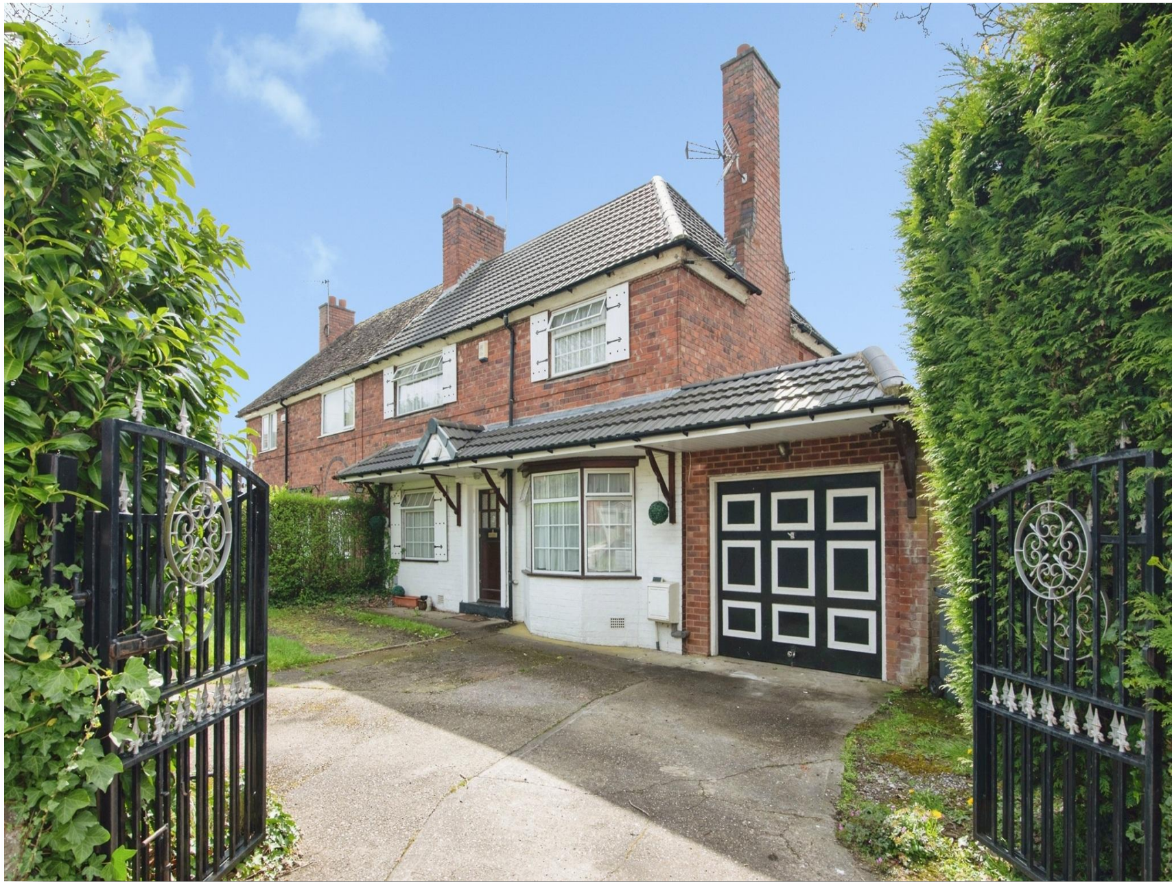
James Road, Great Barr BIRMINGHAM B43 5EU