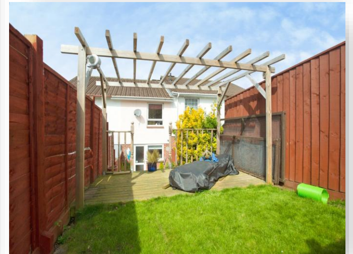
Neal Close, Plymouth PL7 1YY