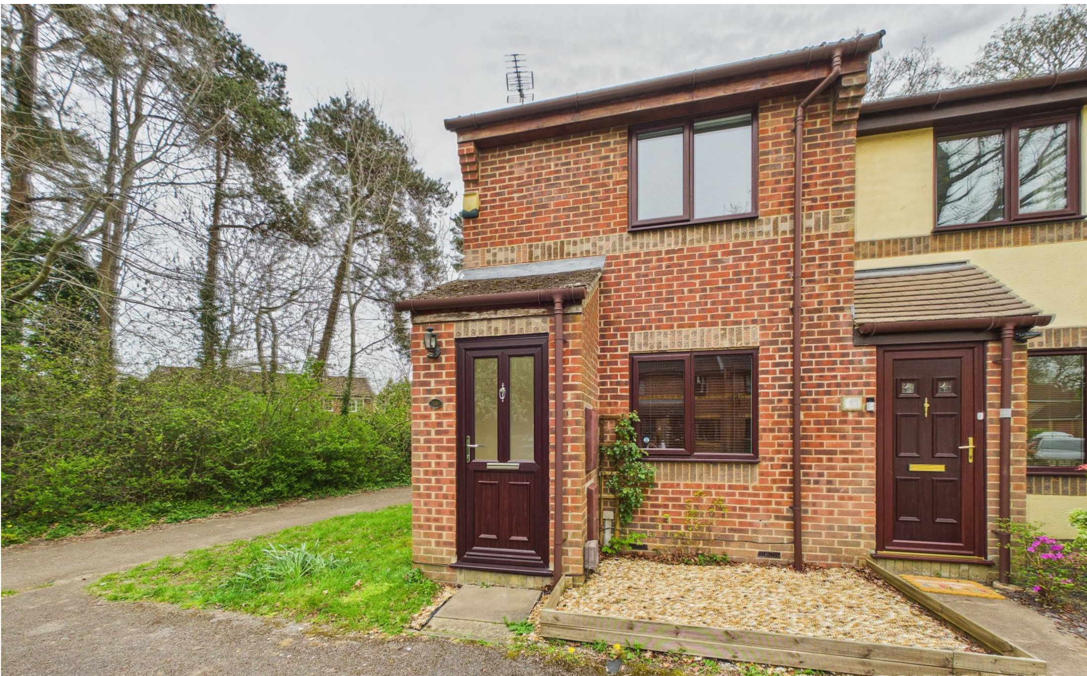
Aghemund Close, Chineham, Basingstoke, RG24 8XP