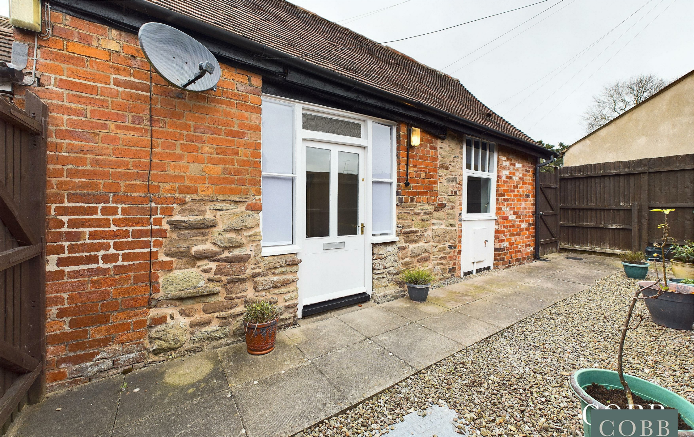
The Courtyard, 11a, School Lane, Leominster, HR6 8AA Price £149,950