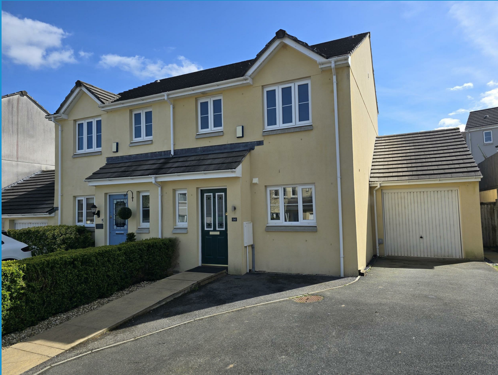
Oak Ridge Lifton | Devon