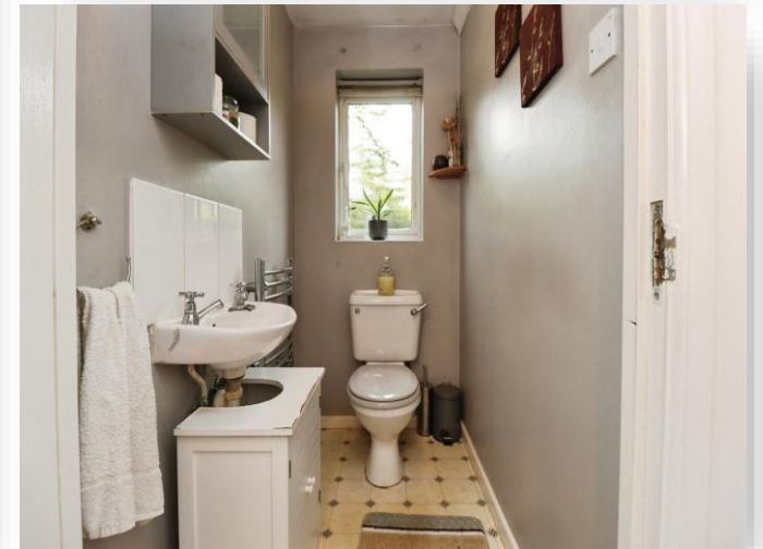
Leighton Close, Wellingborough NN8 4SX