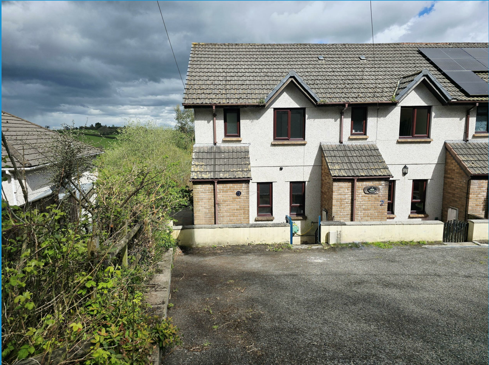
1 Dockacre Court Launceston | Cornwall