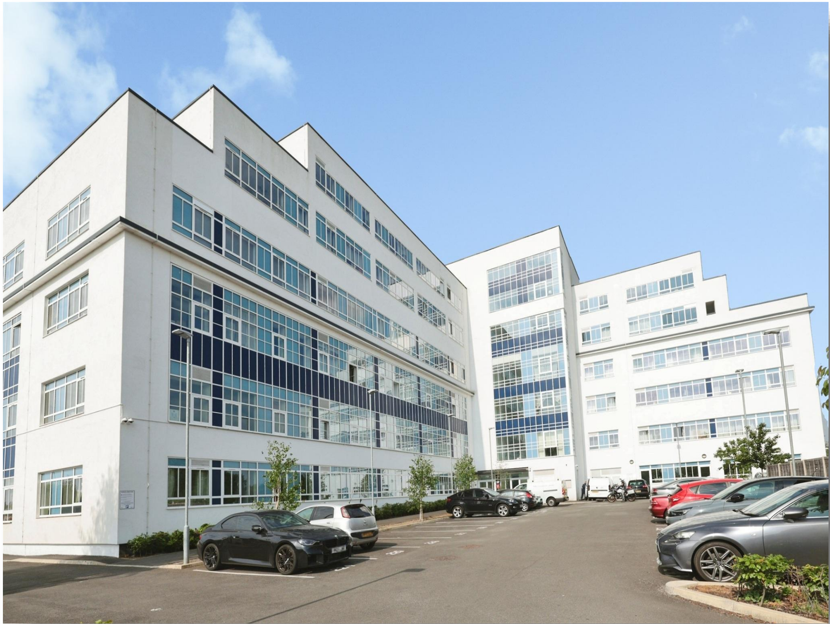
Yeatman Court, Cherry Tree Road, Watford, WD24 6AF