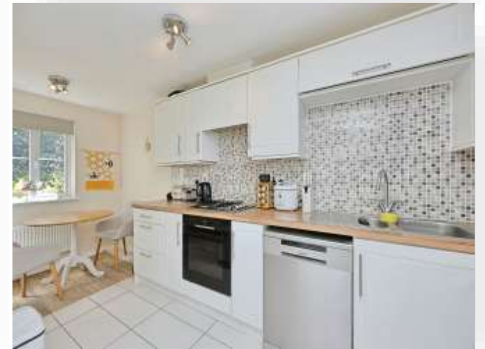
Washington Drive, Carbrooke Thetford IP25 6NY