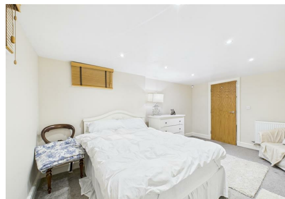
Bedroom One 19'5 x 9'5 (5.92m x 2.87m)