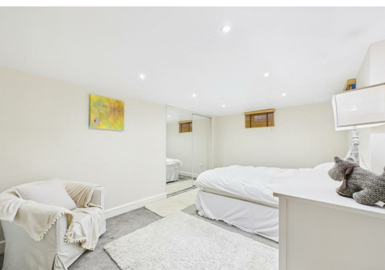
Bedroom Two 15'0 x 10'3 (4.57m x 3.12m)