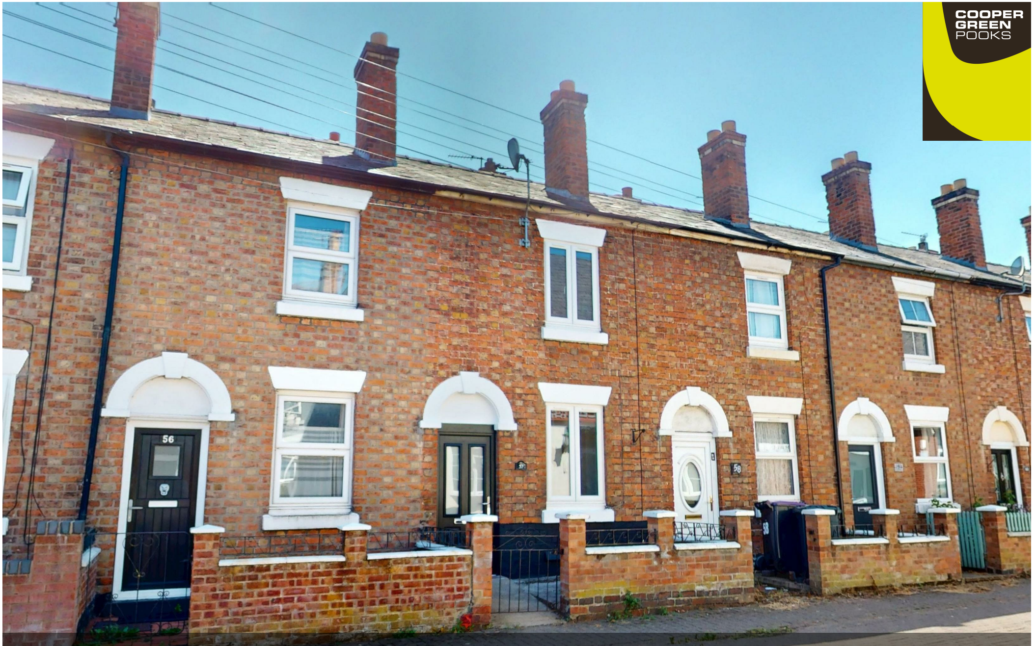
57, New Park Street, Castlefields, Shrewsbury, SY1 2LE £950 Per Month