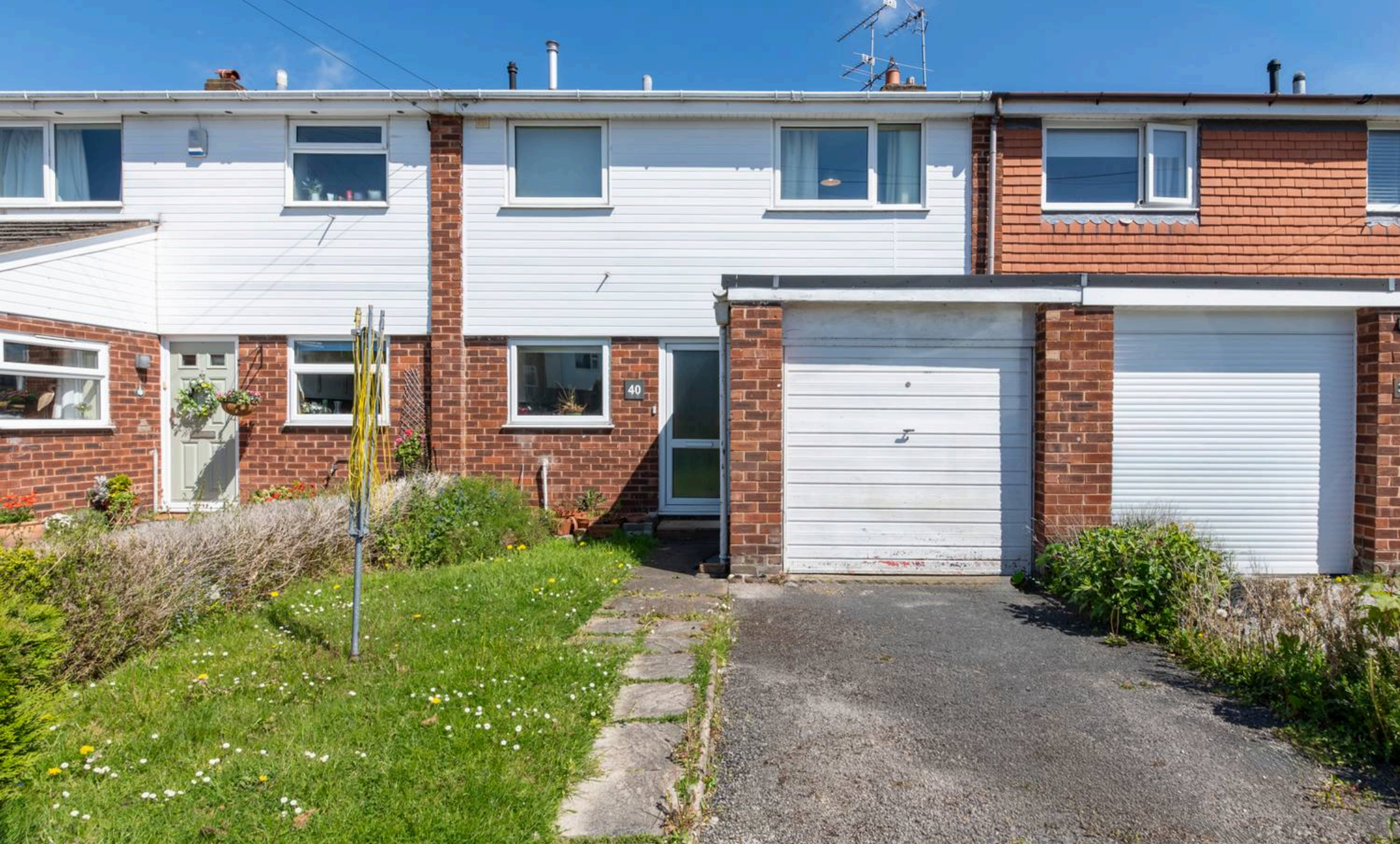
40 Fraser Court, Chester £315,000