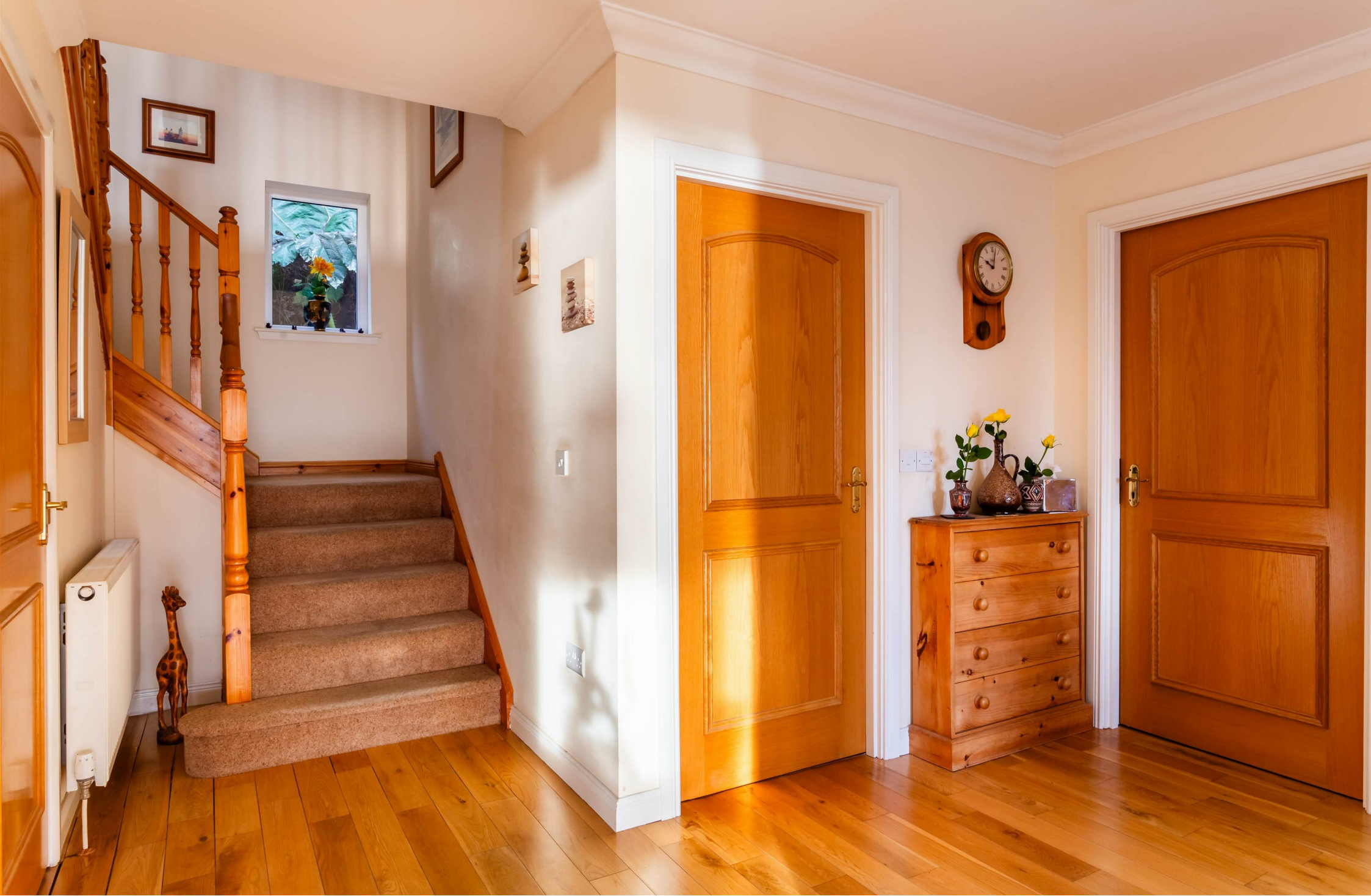
Stonewater House Shore Road, Lamlash, Isle Of Arran, KA27 8JN