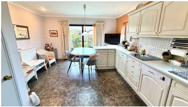
DOUBLE ASPECT KITCHEN/BREAKFAST ROOM 18'3" x 12'11" max overall (5.58m x 3.96m max overall)