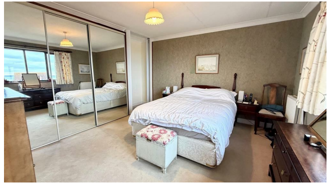
PRINCIPAL BEDROOM 13'10" x 13'1" (4.23m x 4.00m )

Including built-in wardrobes with mirror fronted sliding doors, hanging rails and shelving, coving, double radiator, lift to Lounge, double glazed window to the rear with Estuary and Conwy Mountain views.