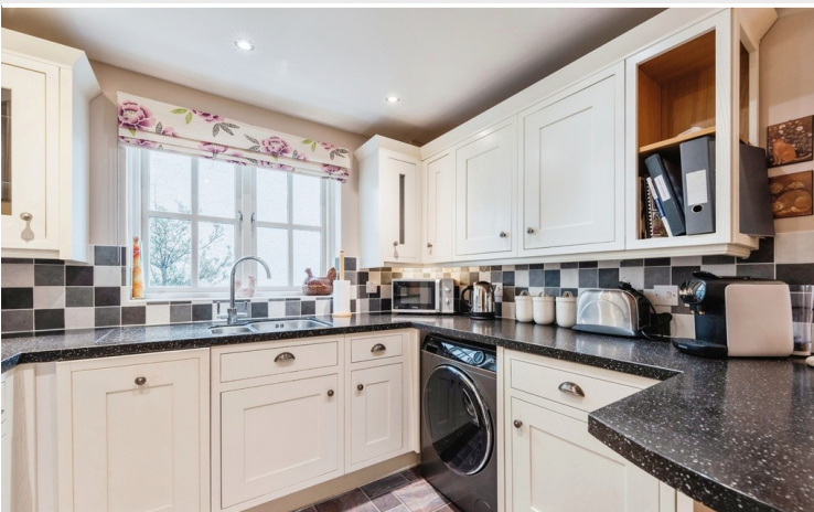
Open Plan Kitchen/Living Room